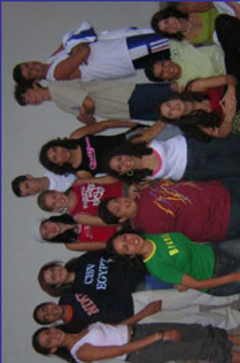
Interchange Delegation Egypt & France 2004