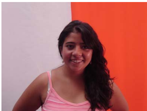
Natis – NIC CISV Colombia