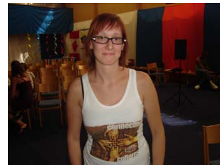
– Trustee CISV Luxembourg